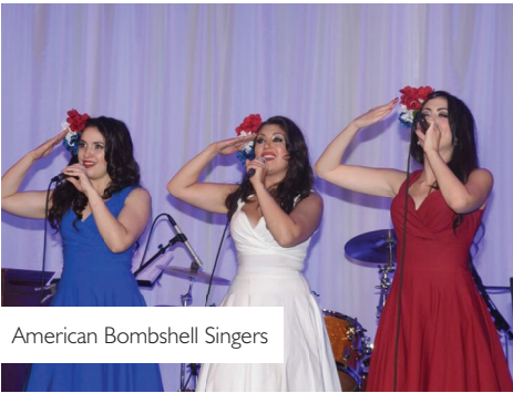
American Bombshell Singers