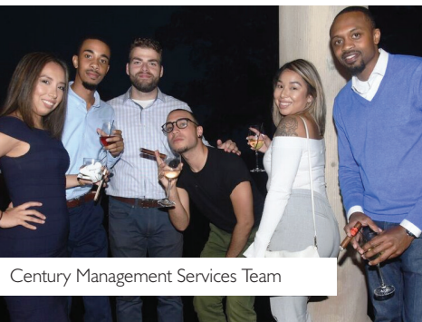
Century Management Services Team