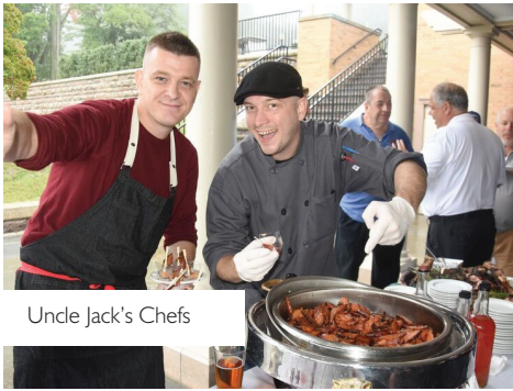
Uncle Jack's Chefs